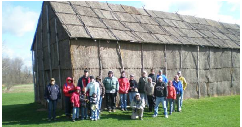
Replica of Seneca Long House at Ganondagan State Historic Site.

May 8- Monkey Run / Bluebird Sanctuary. The morning started at MaryFrances Bluebird Haven with 11 hikers following the perimeter trail around the property. A few muddy spots were encountered, but everyone liked the wooded section. Then it was across the street to hike on the first dedicated VHT trail, Monkey Run. This trail has seen a few changes with the construction of two housing developments, the addition of more trails to the south and finally the clear cutting of a wooded section for the new gas pipeline. Additional picture on page 4.