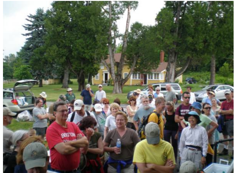
Just some of the crowd ready for the hike.

After a tasty continental breakfast and a short welcome, the trekkers split into three groups, based on how fast they expected to hike. From the trailhead at Valentown Museum, they headed south on the Seneca Trail, passing the Fishers Fire Station on High Street and climbing the hill in back of the new plaza on Route 96. Resting at the top of the hill gives you a chance to take in the view to the west toward Mendon. Then it was down the hill and on to Willowbrook Road, ducking under the Thruway. Up another hill and down through a valley where there was a skirmish between the French and the Seneca Indians in 1687.