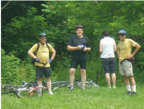
Taking a short rest.