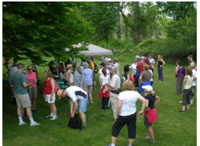
Taking a water break on Dryer Road.