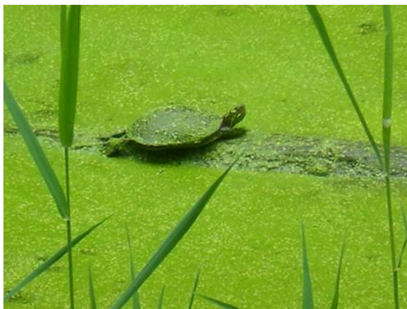
Several turtles were spotted in the small ponds.