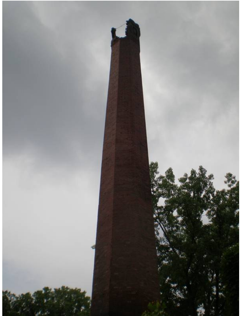
Many industries were located along the creek.