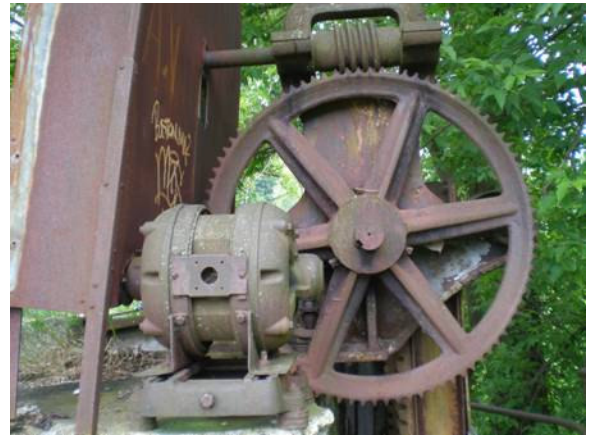
Left-over machinery from another era.