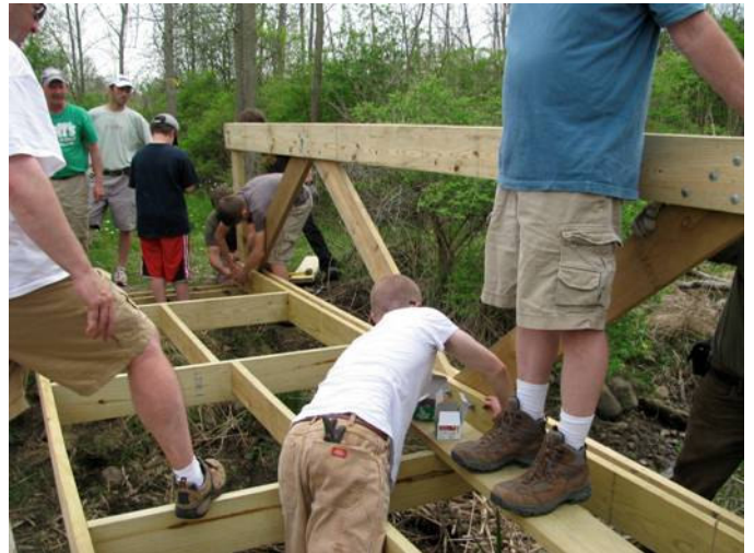
And bolted all the pieces together.