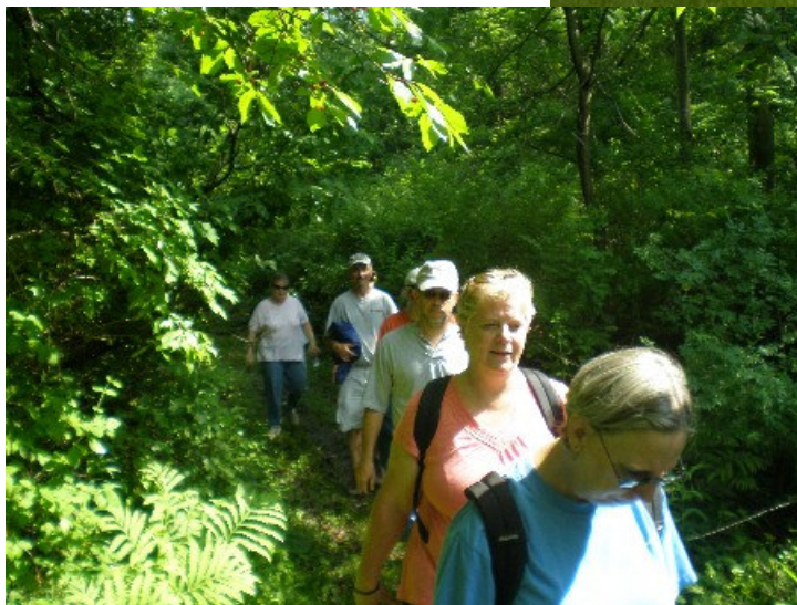
On the Seneca Trail in the Ambush Valley.