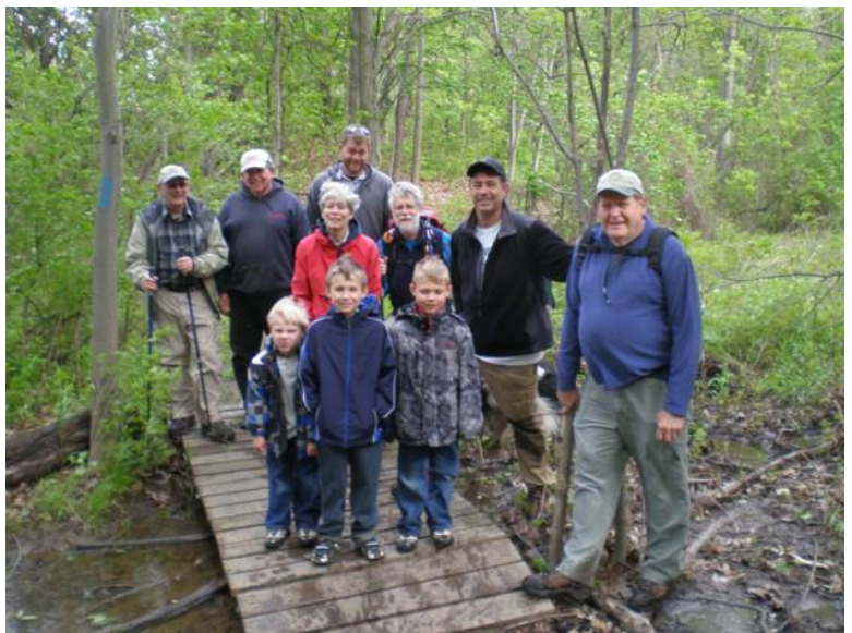
A small bridge in MaryFrances Bluebird Haven. The young boys have become regulars on our hikes, thanks to their Dad.

Jun. 5- National Trails Day – Over 90 people came to Valentown Museum to enjoy a continental breakfast before heading out on the three-stage hike to The Apple Farm. See page 1 for more details and page 4 for more pictures.