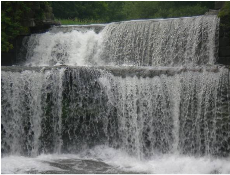
One of several falls on the Outlet.