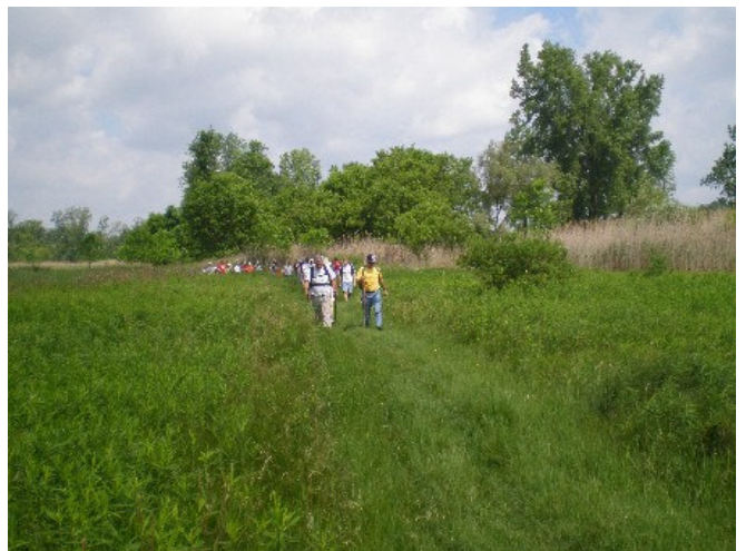
Crossing the field by the Auburn Golf Driving Range.