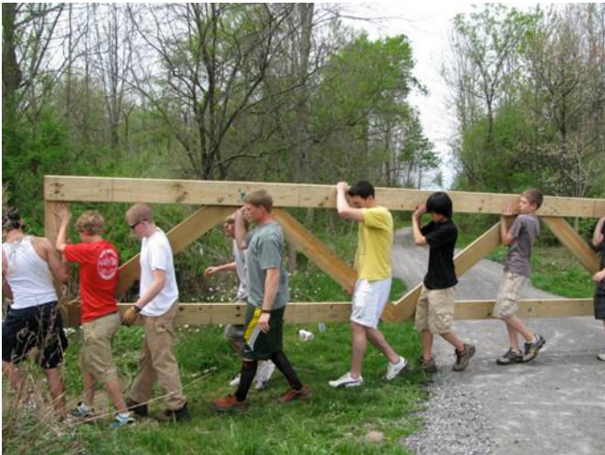
The scouts transported all the materials.