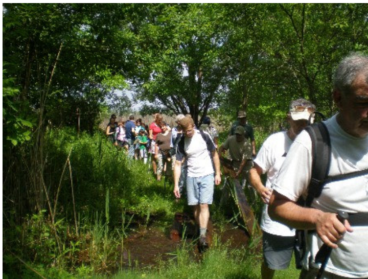
A small bridge is needed here.